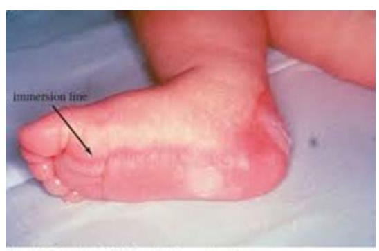
Copyright @2006 by The McGraw-Hill Companies, Inc. All rights reserved.